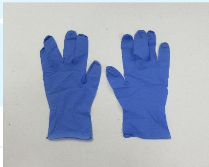
Samples described as 3.2mil (3.3g-3.7g) Powder Free Nitrile Examination Gloves [Ice blue]