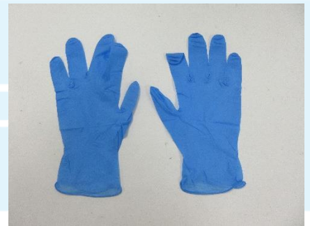
Samples described as 2.2mil (2.7g-3.1g) Powder Free Nitrile Examination Gloves [Regular blue]