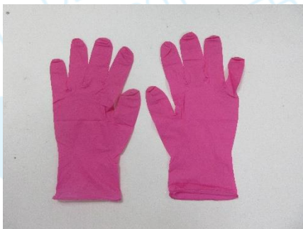
Samples described as 2.5mil (3.2g-3.6g) Powder Free Nitrile Examination Gloves [Pink]