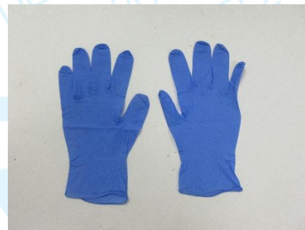
Samples described as 3.2mil (3.3g-3.7g) Powder Free Nitrile Examination Gloves [Bluple]