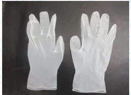
Samples described as 2.2mil (2.7g-3.1g) Powder Free Nitrile Examination Gloves [Clear]