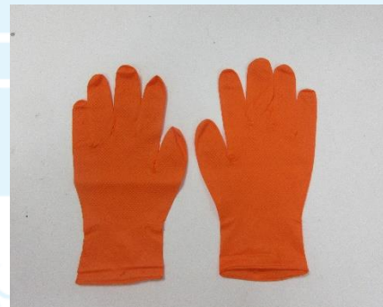
Samples described as 7.0mil (8.2g-8.6g) Powder Free Nitrile Examination Gloves [Orange]