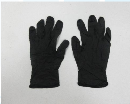
Samples described as 3.2mil (3.3g-3.7g) Powder Free Nitrile Examination Gloves [Black]