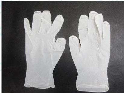
Samples described as 2.2mil (2.7g-3.1g) Powder Free Nitrile Examination Gloves [White]