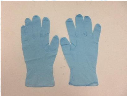
Samples described as 2.2mil (2.7g-3.1g) Powder Free Nitrile Examination Gloves [Sky blue]