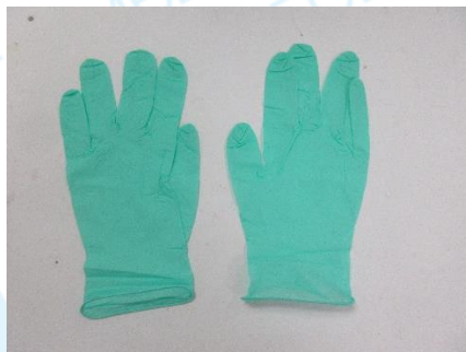
Samples described as 2.5mil (3.2g-3.6g) Powder Free Nitrile Examination Gloves [Teal]