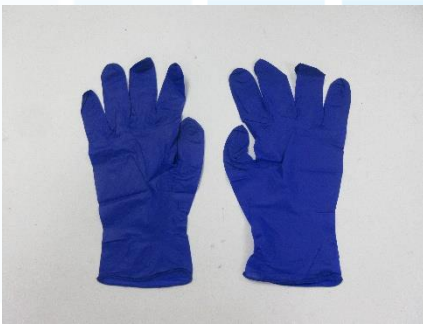
Samples described as 2.2mil (2.7g-3.1g) Powder Free Nitrile Examination Gloves [Cobalt blue]