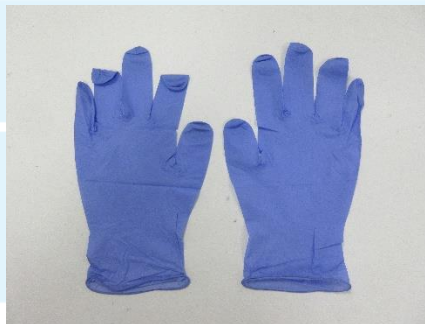
Samples described as 2.2mil (2.7g-3.1g) Powder Free Nitrile Examination Gloves [Purple blue]